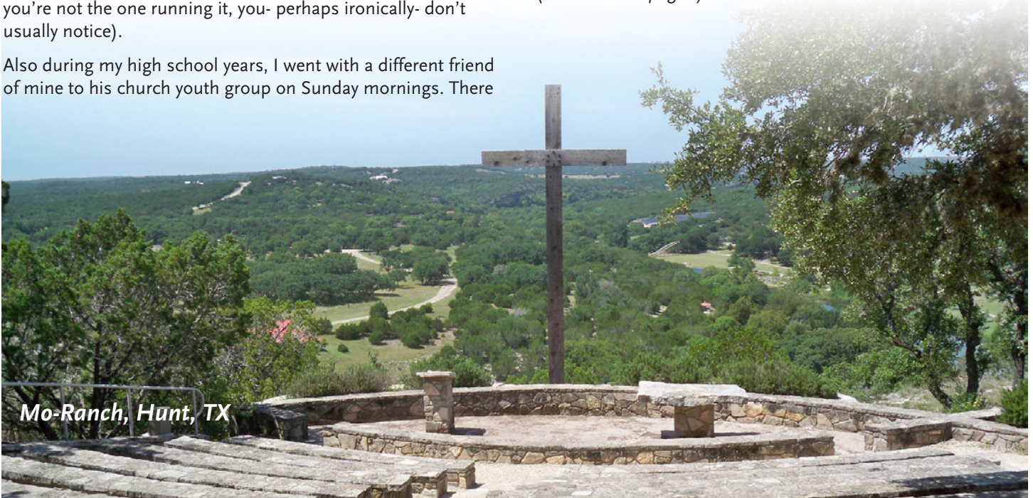
Mo-Ranch, Hunt, TX

To love and serve Christ. To love and serve one another in Christ. To love and serve the world for Christ.